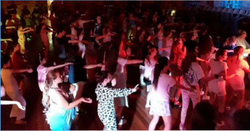
The Macarena was a big hit on the night!