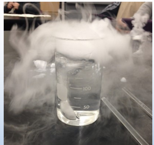
"Dry Ice" Fun for Year 7

For those at school, a bit of fun was had with a Science Week Quiz on Assembly, fun prac lessons with Dry Ice, and some special 'Space themed' awards presented to students