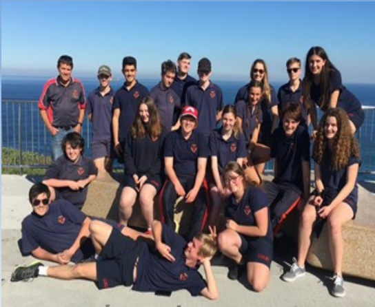
The crew in Newcastle