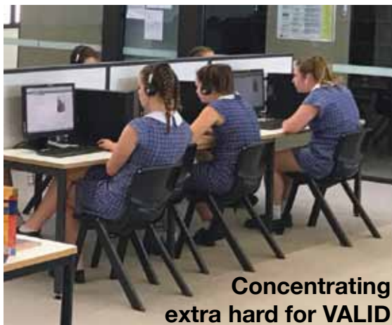
Concentrating extra hard for VALID