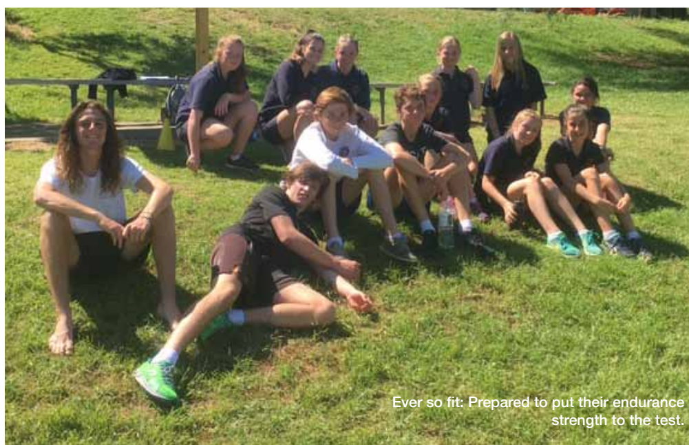
Ever so fit: Prepared to put their endurance strength to the test.