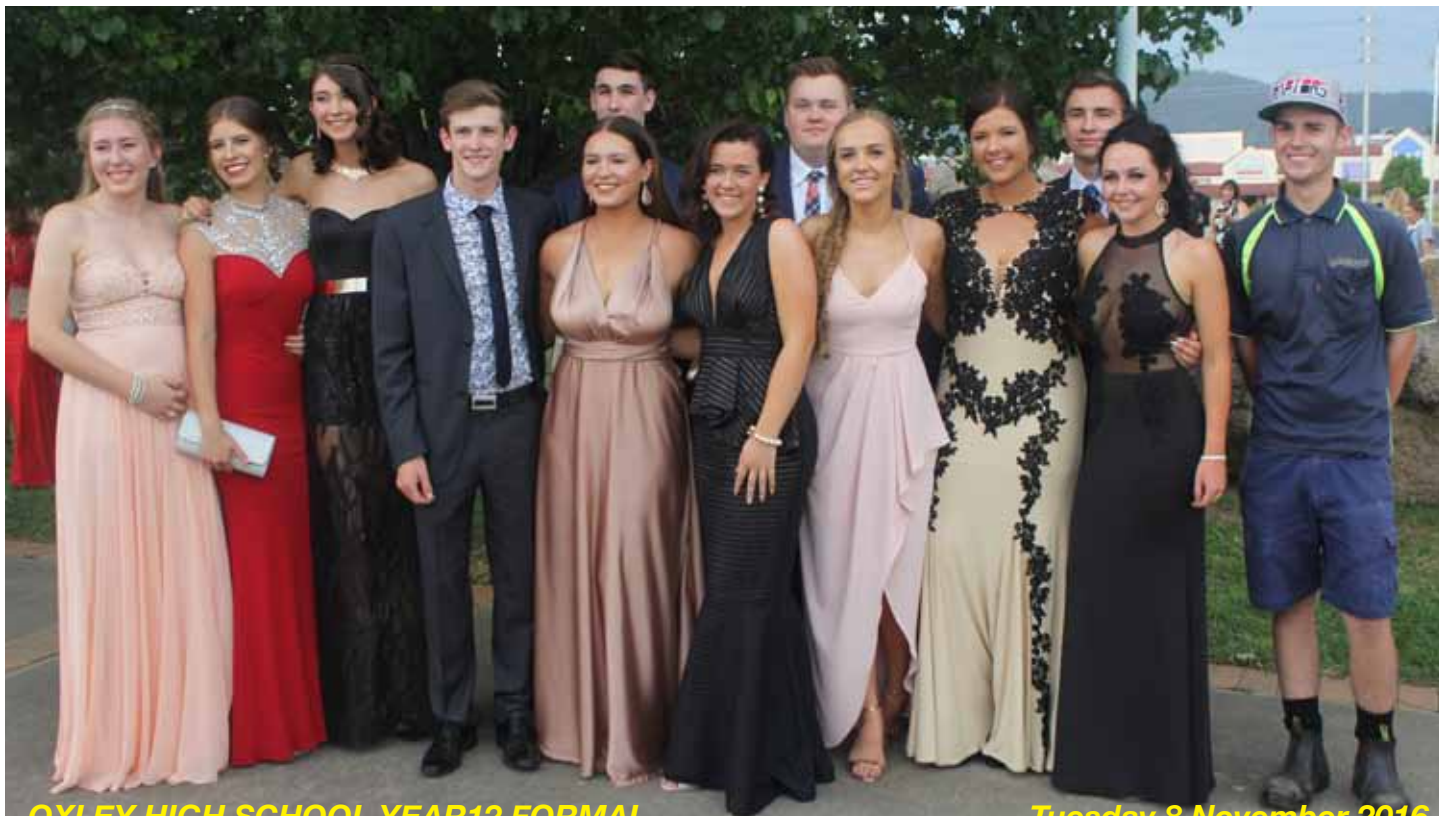
OXLEY HIGH SCHOOL YEAR12 FORMAL