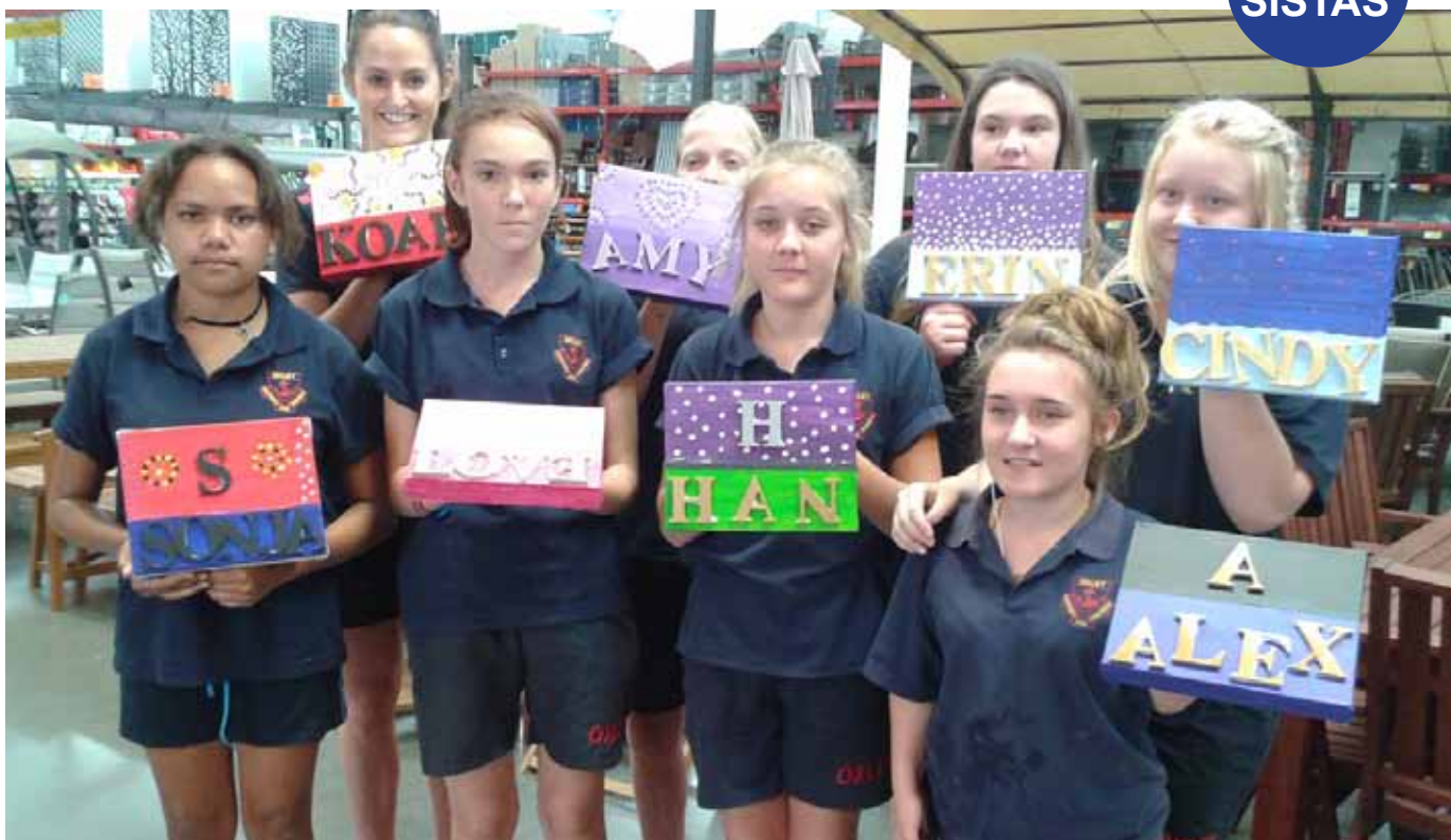
Oxley High School students participating in the Big Sistas program at Bunnings. Check the School Plan available on the Oxley website for information about the Sistas Program and other details.